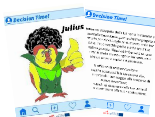
5 Characters cards