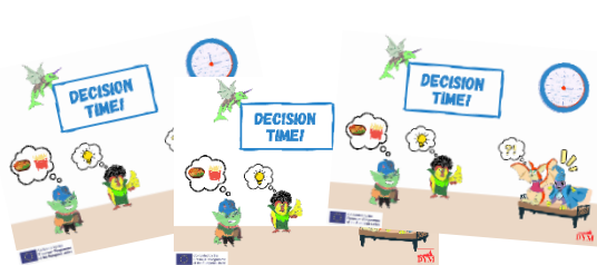
Deck of 55 cards