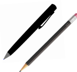
1 pen per player