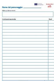
1 account sheet per player